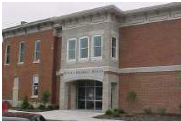
Hancock Historical Museum

The Hancock Historical Museum is a local history museum dedicated to the preservation and dissemination of the history of Hancock County, Ohio. The museum has permanent displays relating to the history of the county from its geological formation into the latter 20th century and covering all